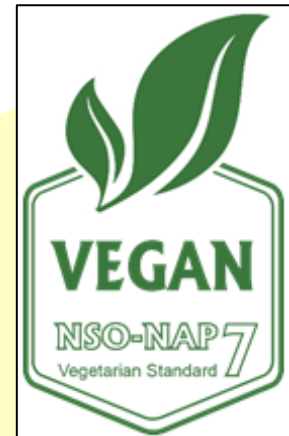
Certificate No: XXXXYZ Figure 3: Green-White Logo