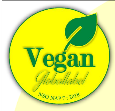
Figure 7: Green-Yellow Alternative Logo