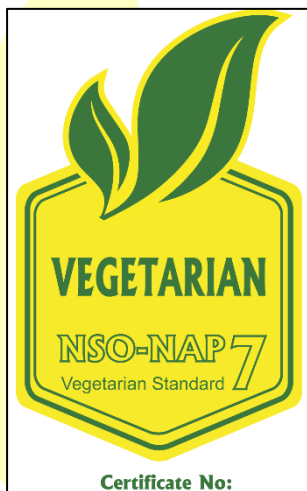
Certificate No: XXXXYZ Figure 4: Yellow-Green Logo