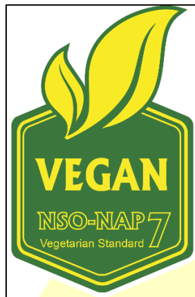
Certificate No: XXXXYZ Figure 2: Green-Yellow Logo