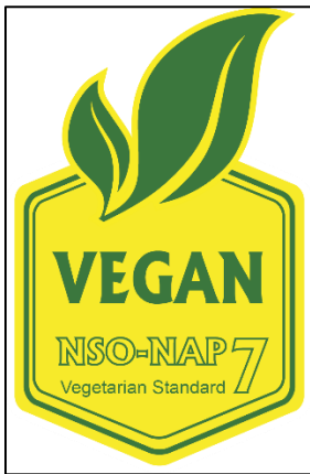
Certificate No: XXXXYZ Figure 1: Yellow-Green Logo