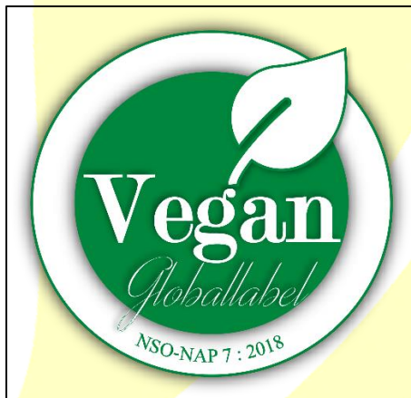
Figure 8: Yellow-Green Alternative Logo