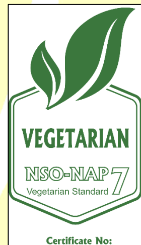
Certificate No: XXXXYZ Figure 6: Green-White Logo