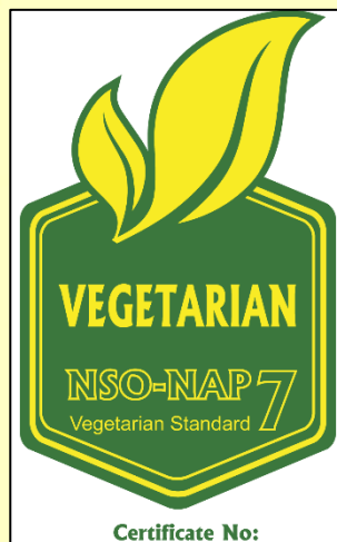
Certificate No: XXXXYZ Figure 5: Green-Yellow Logo